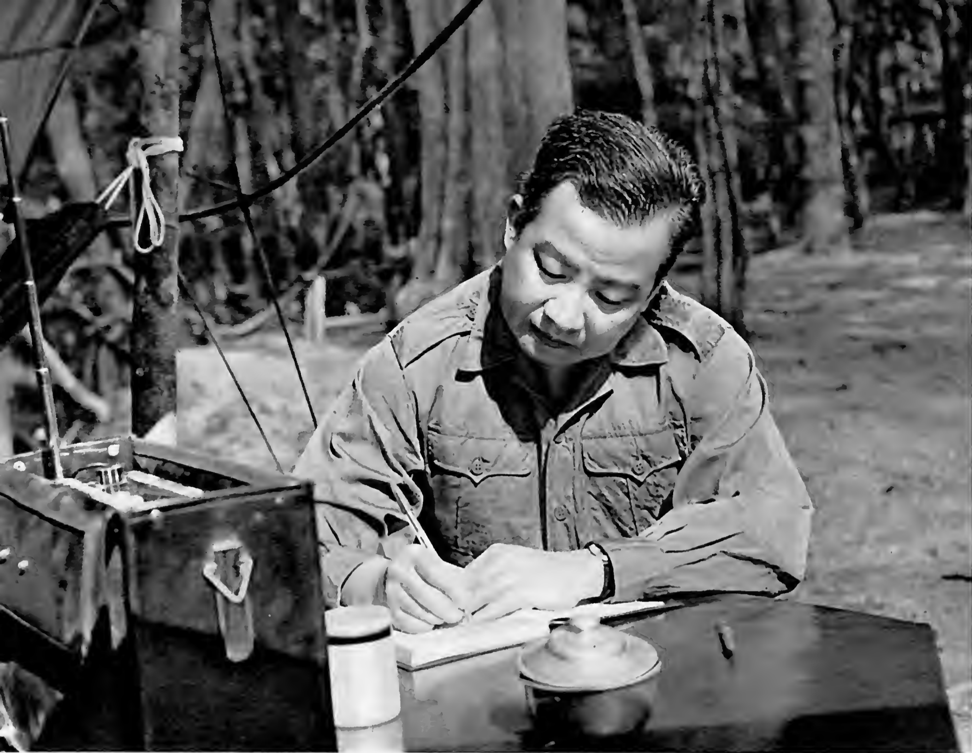
At the camp ground.